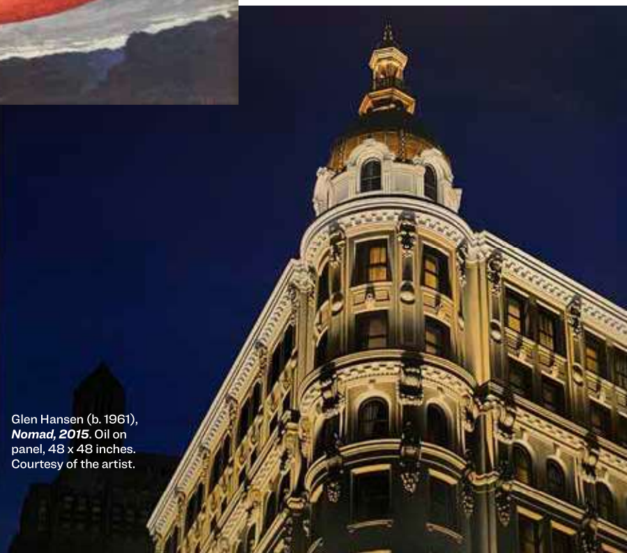
Glen Hansen (b. 1961), Nomad, 2015 . Oil on panel, 48 x 48 inches.

Set on the historic Frick Estate grounds, the Nassau County Museum of Art has unveiled its latest major presentation: Real, Surreal, Photoreal . Running now through March 8, 2026, this must-see exhibit invites visitors into a reality that is uncertain, where dreams take shape and the line between fact and imagination disappears.