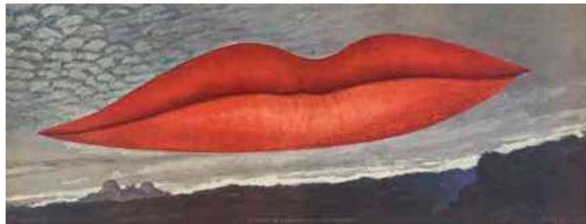
Man Ray (Emmanuel Radnitzky) (1890-1976), Observatory Time: The Lovers (A.15), 1967, Lithograph on paper; H. Manes Art Foundation.

Real, Surreal, Photoreal Opens at The Nassau County Museum of Art